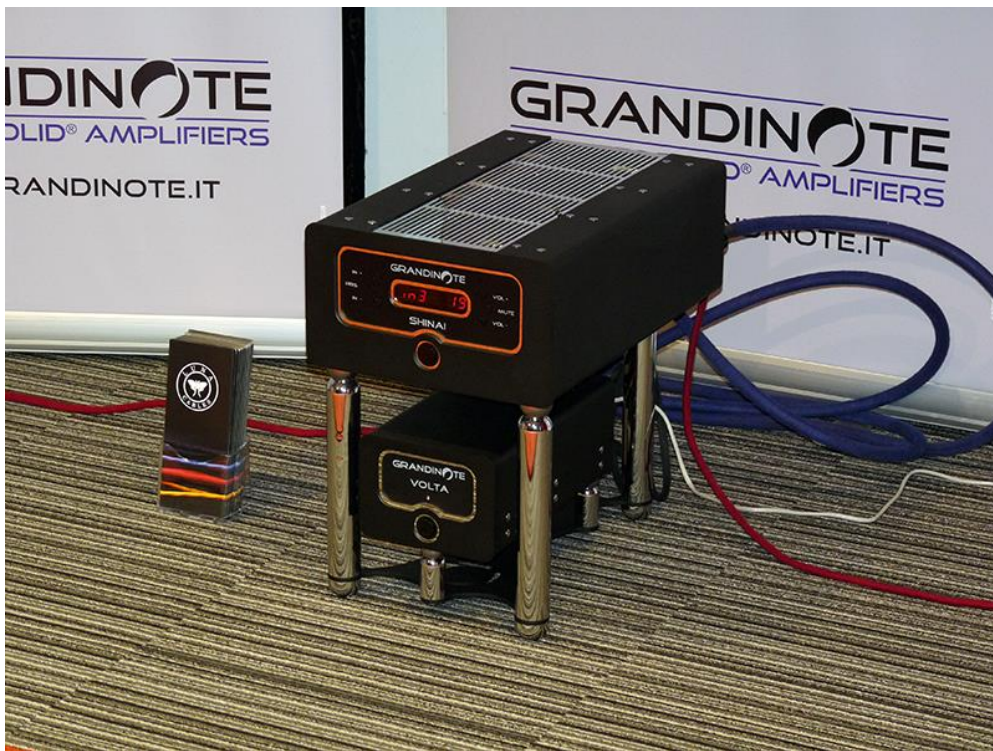
SHINAI : A FERRARI among Amplifiers