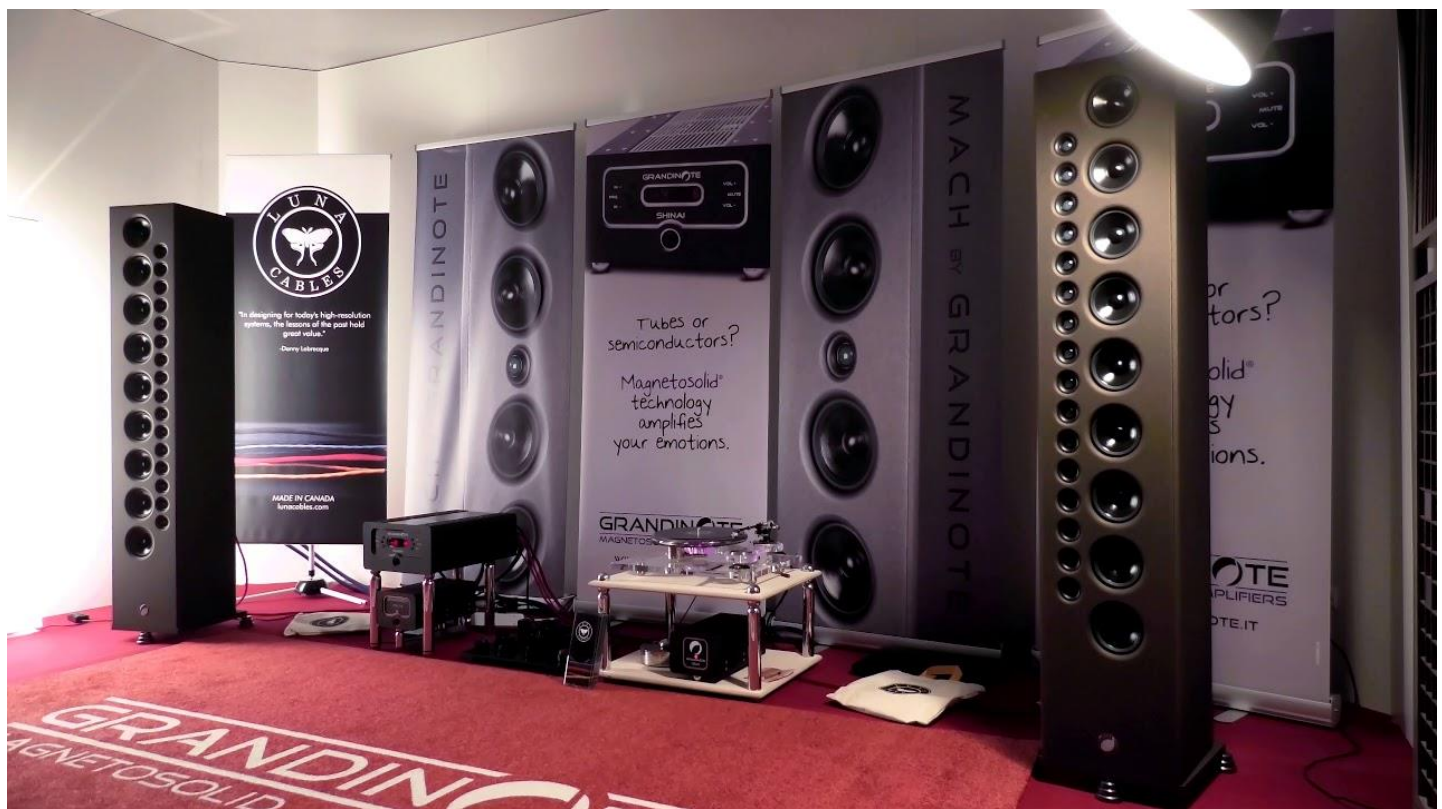
HIGH END SHOW MONAXO 2018-2019 - BEST SOUND !!